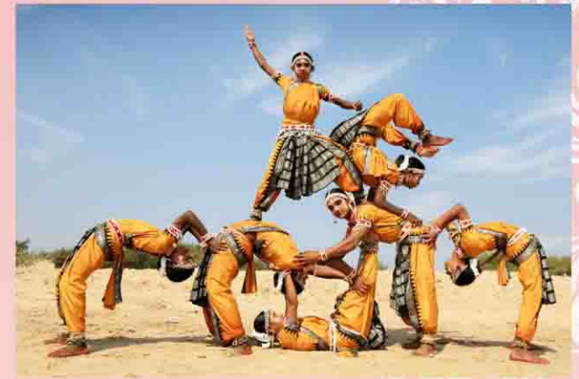
ABHINNA SUNDAR GOTIPUA NRUTYA PARISHAD

The repertoire of the dance includes Vandana-Prayer of God or Guru; SARIGAMA-a pure dance number; Abhinaya-Enactment of a song & Bandha Nrutya-presentation of acrobat yogic postures, creation of images of Radha Krushna-having similarity to visual presentation drawn up by Pattachitra Artists. Musical accompaniment is provided with Mardala, Gini, Harmonium, Voiline & Flute.