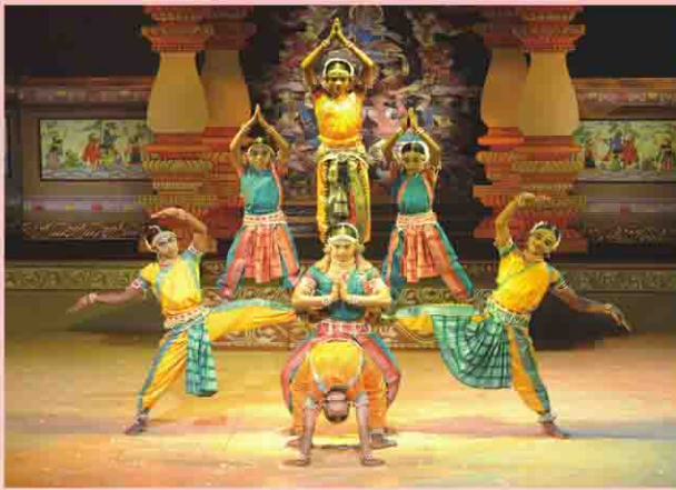
(The Gotipua Dance Majestic Folk Dance of Odisha) Brief History:

The evolution of Gotipua Dance tradition can be traced to the tradition of Mahari or Devadasi connected to the famous Lord Jagannath of Puri Dham, Odisha who could not dance outside. Therefore young boy & later boys dressed in female costume replaced them at different festivals and gathering.